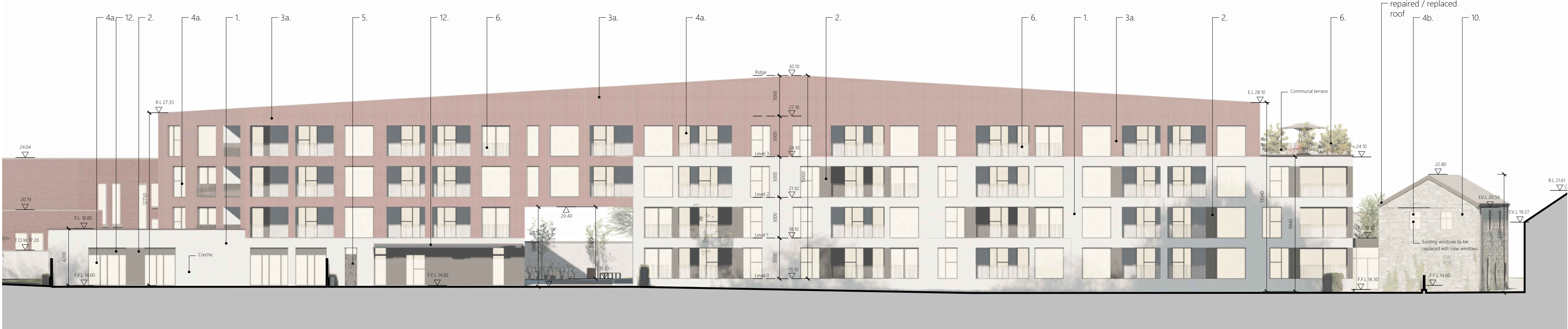
4 BUILDING D&A: SOUTH ELEVATION D4 SCALE 1:200