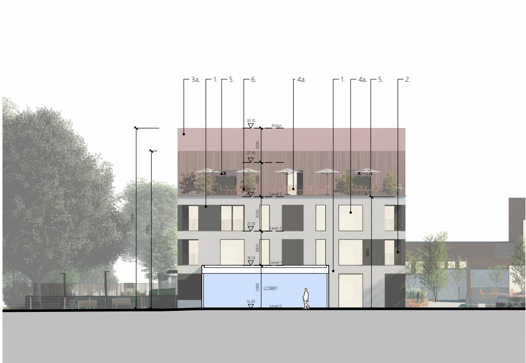
6 BUILDING D: EAST ELEVATION D5 COMPLIANCE SCALE 1:200