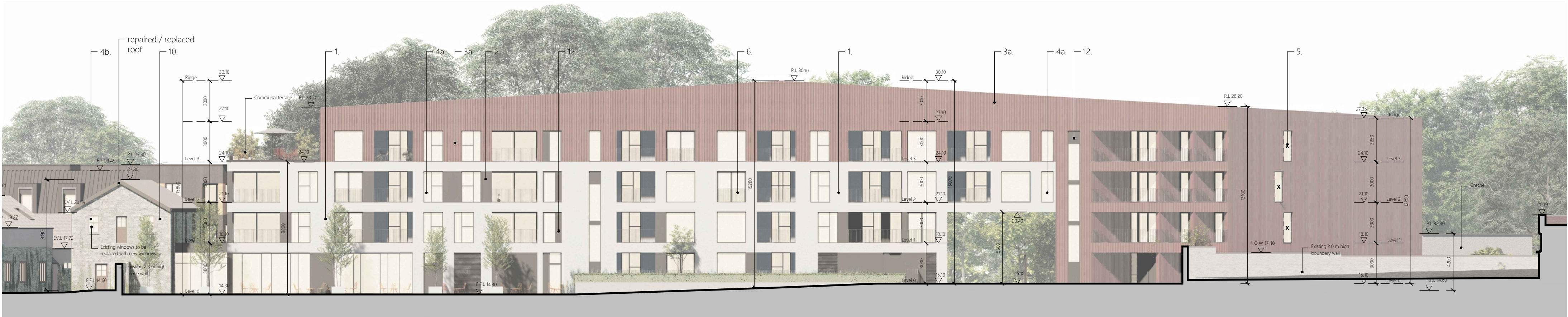
3 BUILDING D&A: NORTH ELEVATION D3 SCALE 1:200