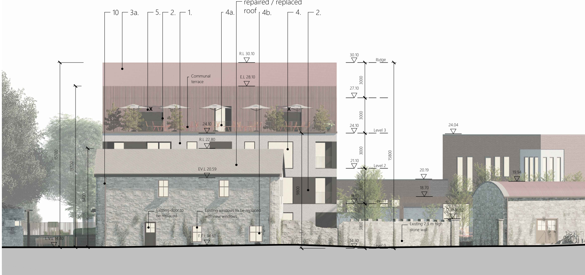
1 BUILDING D&A: EAST ELEVATION D1 SCALE 1:200