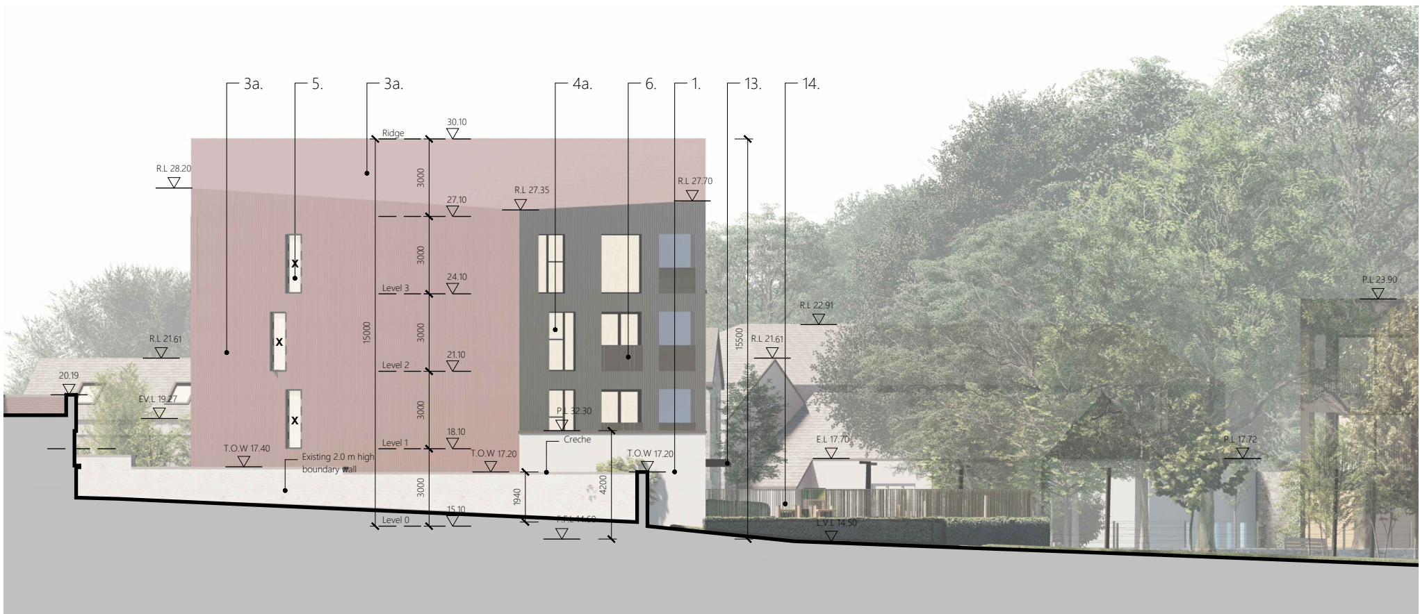
2 BUILDING D: WEST ELEVATION D2 SCALE 1:200